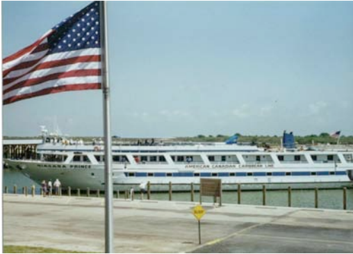
With a 15 ft. harbor depth, the cruise ship Niagara Prince easily comes to dock at our bulkhead.