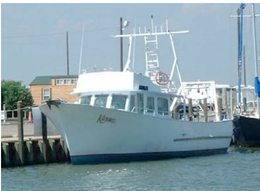
Matagorda Harbor is proud to be the home port of the Texas A&M Marine Advisory Service classroom vessel Karma . Aboard, students get a hands-on lesson in marine biology.

Matagorda Harbor opened in 1990 as part of the Mouth of the Colorado River Project , a joint project by the U.S. Army Corps of Engineers and the Port of Bay City Authority. Over the years the harbor has evolved to meet the needs of both pleasure and commercial traffic along the Gulf Intracoastal Waterway.